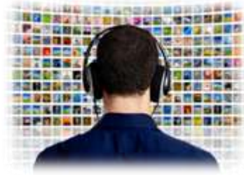
Multi-media & Motion Picture Marketing