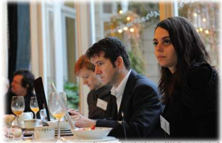
Club e-Luxe Breakfast Seminar 2011, Photo by Xavier Granet

“The club-like atmosphere created by Luxe Corp not only provides a more bespoke look at the future of technology in luxury but also a chance to make some quality contacts in the process” - Vertu