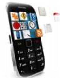
Mobile Marketing, Privacy & Legislation