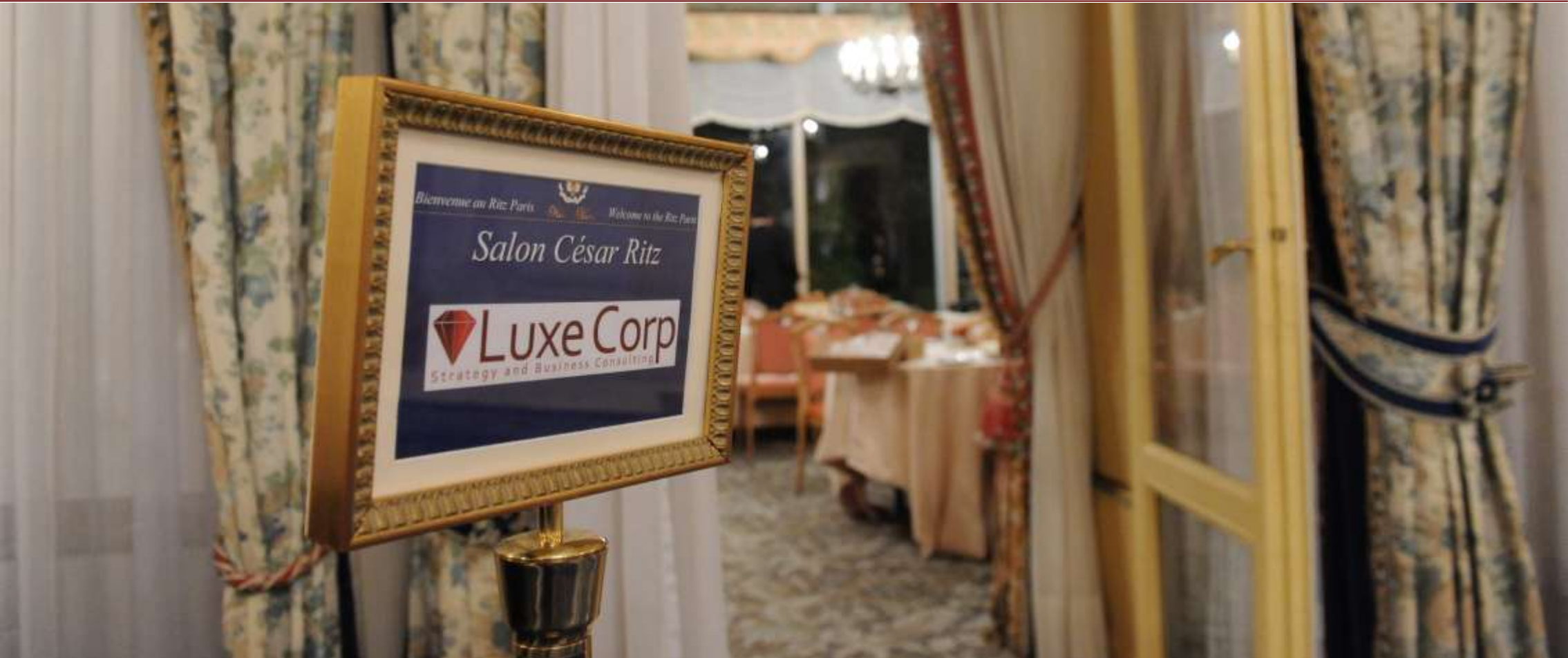
Club e-Luxe Breakfast Seminar 2011