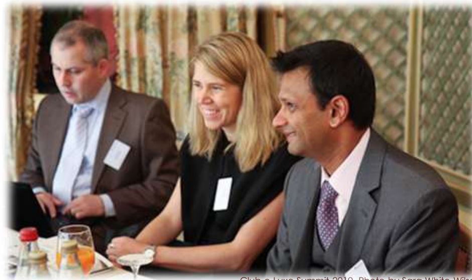
Club e-Luxe Summit 2010

"I've been to the Club e-Luxe Summit twice. The first time was a great discovery and this second time I witnessed an excellent and thoughtful day, an eye-opener and a great place to exchange ideas about a key area of the luxury business. Well done and looking forward to the next session" - Deal China