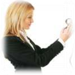
E-Client Insights & Neuromarketing