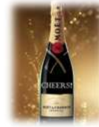
Customization & Creation