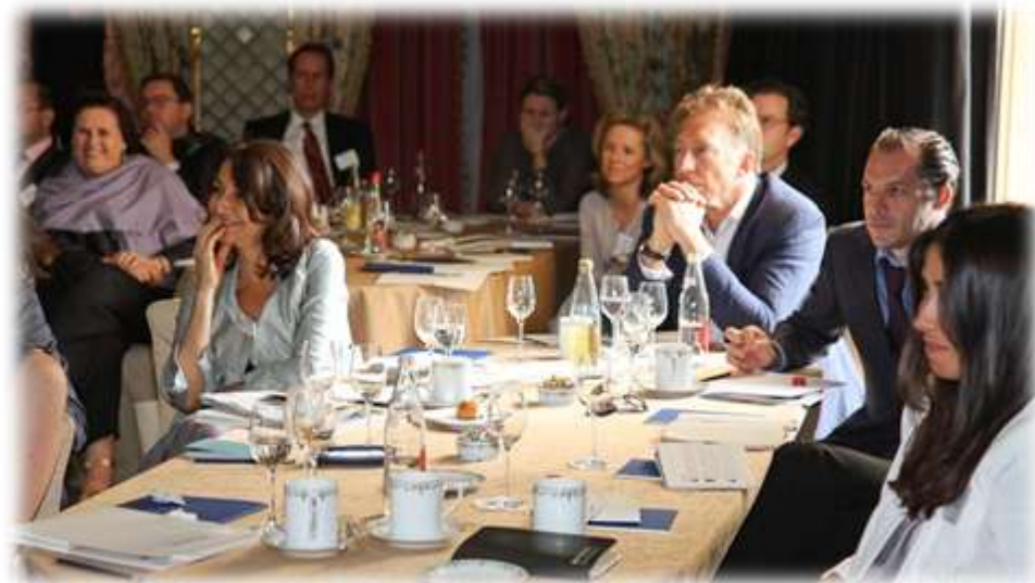
Club e-Luxe Summit 2009

“A good mix of speakers touching on subjects that broaden the cyberspace business and points to the future. Listening to the advice of experienced people is reassuring. I look forward to the next Club e-Luxe Summit.” – Browns