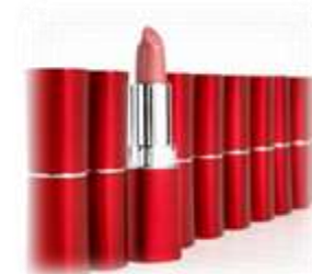
Website, e-Boutique & Luxemosphere Creation