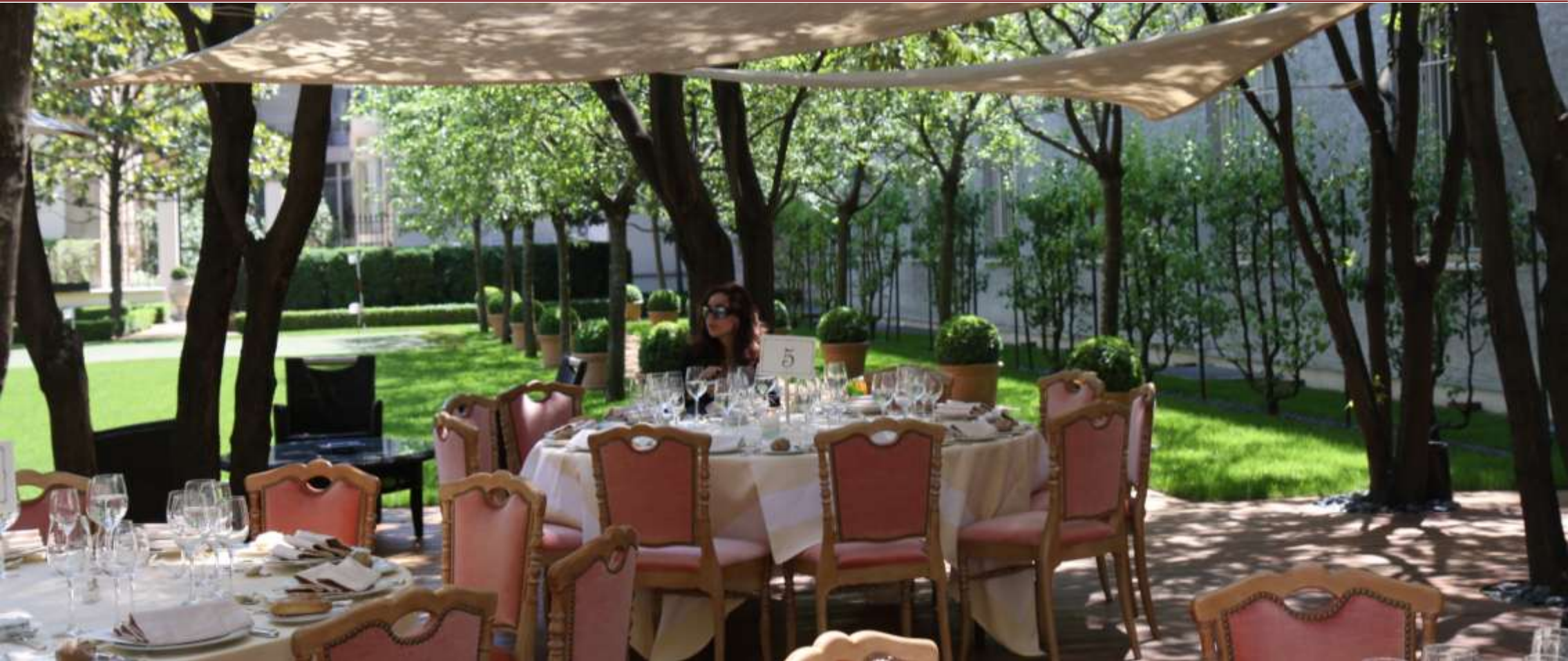
Club e-Luxe Summit 2010