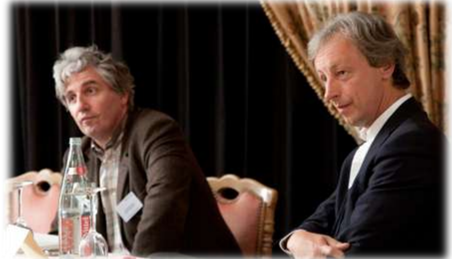
Club e-Luxe Summit 2010

“Thank you for a beautiful day packed with diverse and insightful information concerning the luxury industry today. It was a pleasure to attend and I look forward to next year” – Labelux