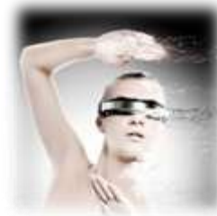
Virtual Reality & Gaming