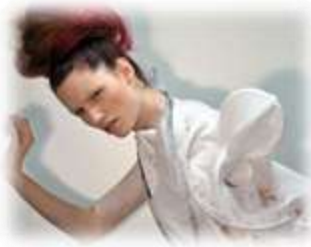
Digital Products & Services