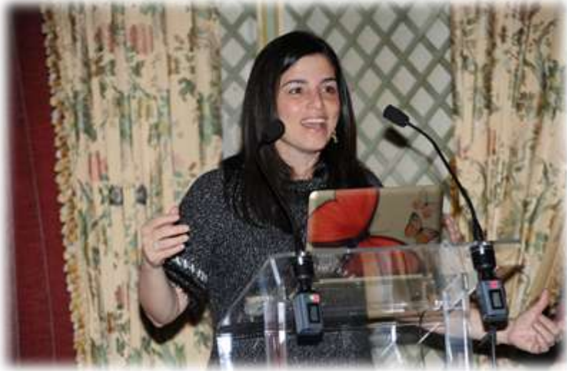
Club e-Luxe Breakfast Seminar 2011, Photo by Xavier Granet

“A fantastic opportunity to listen, share and learn about various international perspectives on how luxury brands should embrace and adopt an online strategy and e-commerce. A fun and inspiring day.” - Gilt Groupe