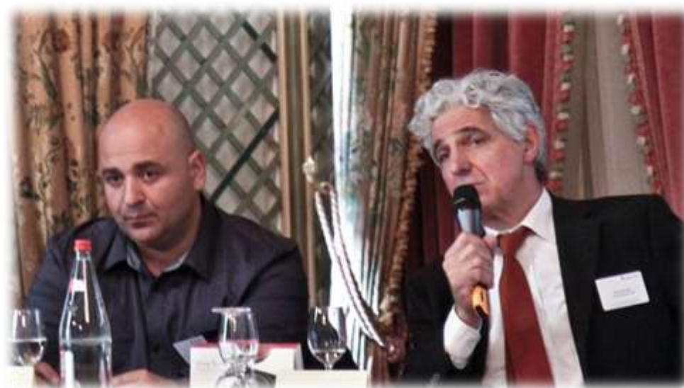
Club e-Luxe Summit 2010

“Thank you for a beautiful day packed with diverse and insightful information concerning the luxury industry today. It was a pleasure to attend and I look forward to next year” – Labelux