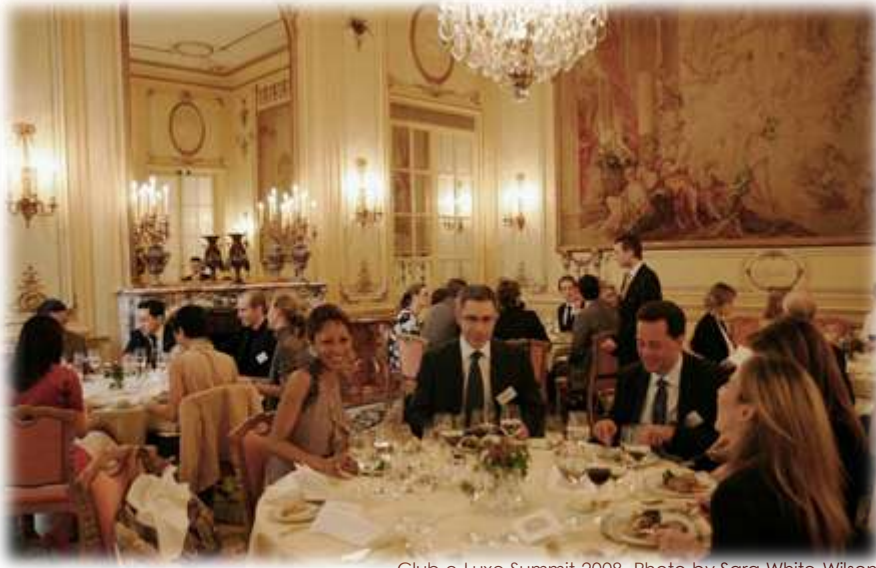
Club e-Luxe Summit 2008

"The Club e-Luxe Breakfast seminar provided valuable insight from the leading visionaries in luxury retail." - Cisco Systems