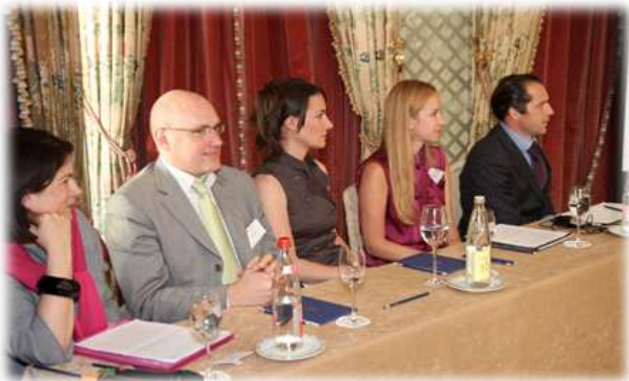
Club e-Luxe Summit 2009

“I must congratulate Luxe Corp for creating a very stimulating and engaging event. The speakers were excellent and very diverse, the overall event design was impressive.” – HP