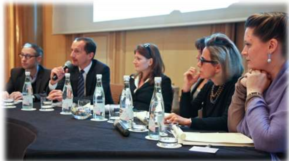
Club e-Luxe Breakfast Seminar 2010

“Club e-Luxe has become the most e-nnovative forum. Thank you for creating such energy!” – Hotel Le Meurice, Paris