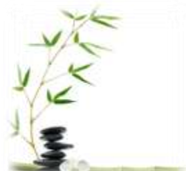
Sustainability & Ethics