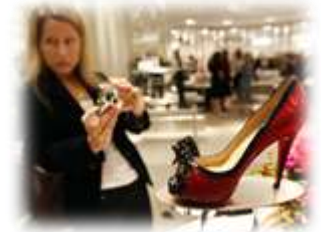
Luxury Market Dynamics