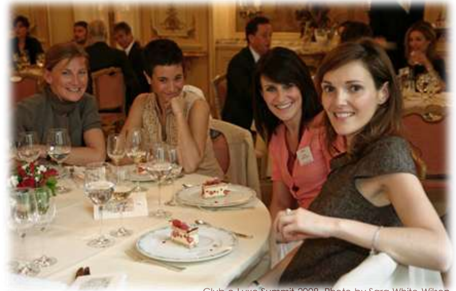
Club e-Luxe Summit 2008

"I enjoyed the intimate gathering of Club e-Luxe in the most beautiful setting and took home valuable inspiration and learning." – Retail Institute