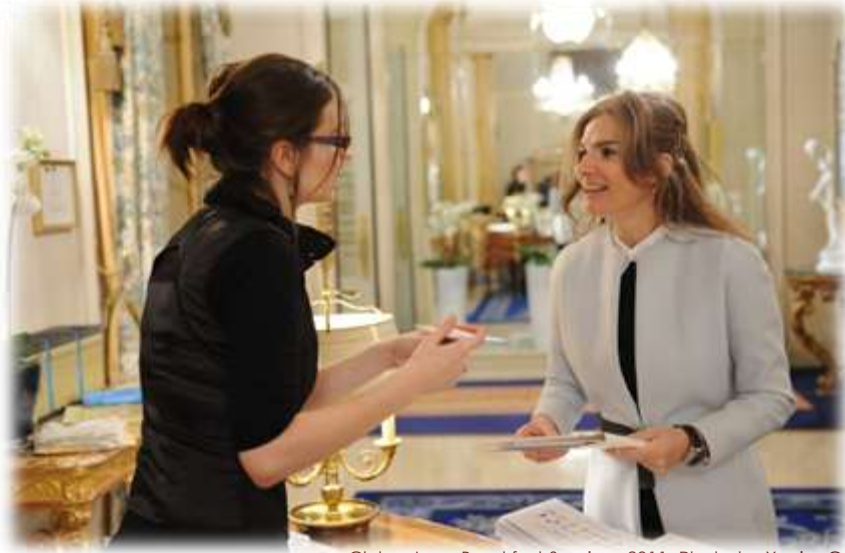
Club e-Luxe Breakfast Seminar 2011

“I really enjoyed the Club e-Luxe Summit. A full intensive day with a rich repertoire of cases and strategies for developing successful e-Luxe initiatives.” – Gucci Group