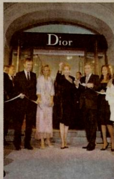
Top, Mikhail Gorbachev in the Louis Vuitton luggage ad. Sharon Stone, who has two Dior ad contracts, cutting the ribbon to open a Dior store in Moscow.

"You're entering a market that huge, where a bunch of brands are competing — you use Jude Law and put an Aston Martin next to him, and immediately you've established modern British heritage."